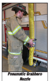
Pneumatic Grabbers Nozzle