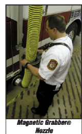
Magnetic Grabbers Nozzle

Installations and Departments under contract for the PLYMOVENT SYSTEM